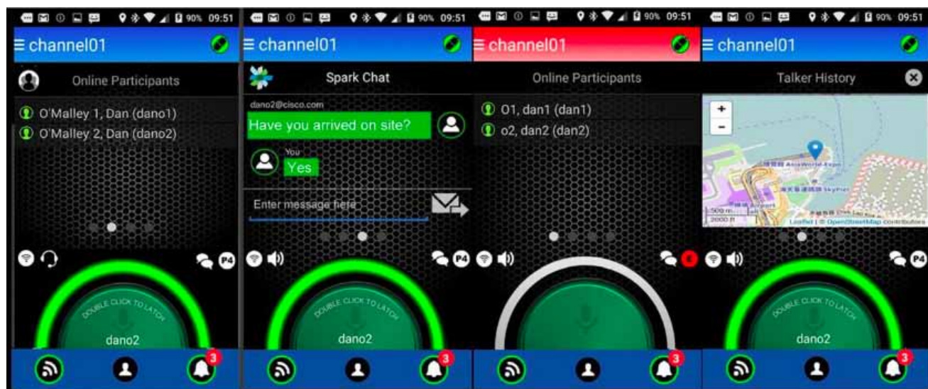
Figure 2. Instant Connect Mobile Client

Mobile client users see the presence of other users on their channel, and can also participate in secure group chat using Instant Connect Incidents (on premise). Instant Connect also provides the ability to route major and minor alerts to mobile clients and dispatchers. Now users can see a static and dynamic mapping history on the mobile client or on the dispatch application. (See Figure 2 above)