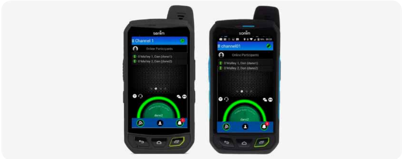
Figure 3. Instant Connect on Sonim XP 7 phones

Major benefits of Instant Connect on a Sonim phone or BYOD Android/Apple include: